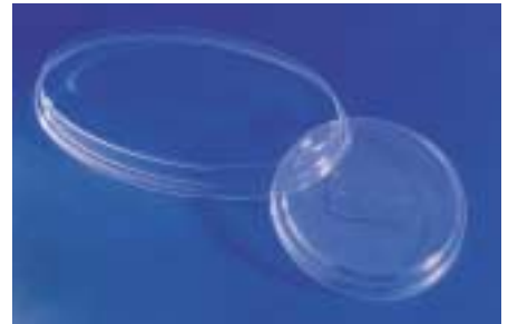
Passenger meals are already being served on the new dishes, trays and covers from AVI GmbH.

The switch from conventional injection-moulded, reusable trays to the new, disposable thermoformed trays brings convincing benefits. Manufacturing costs shrink thanks to far lower mould costs. There are more cost savings in the sky, thanks to lower part weight and to the fact that used trays no longer have to be collected, handled and washed.